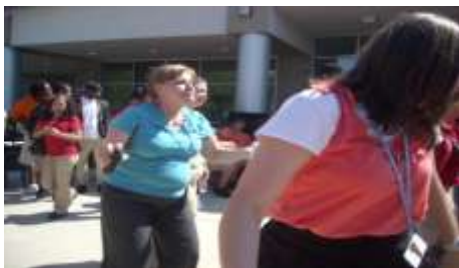
A Team Player